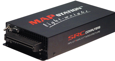
Lightweight Enclosure 3"H x 6"W x 9"D 4 lbs.

SRC® Portable MAPstation systems are miniaturized computer systems based on SRC Computers' IMPLICIT+EXPLICIT™ Architecture and reconfigurable MAP® processor, and they are software compatible with all other SRC products. Ruggedized models have up to 12 Gbytes per second of direct sensor I/O bandwidth in a single processor and weigh less than 7 pounds while using only 20 watts of power for typical applications. Lightweight models offer the same levels of performance in a package weighing just 4 pounds.