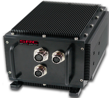
SRC-7 Ruggedized Portable MAPstation Enclosure 3.5"H x 7.5"W x 10"D <7 lbs.